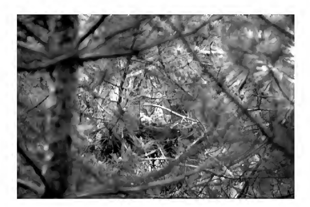
Nest with young Long-eared Owls, Garrett County, May 16, 2000.

Talbot County site on May 8 did not turn up any Long-eared Owls and revealed no evidence of nesting, though the search was not thorough enough to eliminate the possibility. Given the oft-cited difficulty of finding breeding evidence in this species, we deem it likely that the species persists as a regular nester in Maryland, though focused searches will be necessary to confirm this. Such searches should concentrate on known winter roost sites and in pine groves amid or adjacent to extensive suitable fields that are rich in rodent life, especially those known to host Short-eared Owls and Northern Harriers in winter.